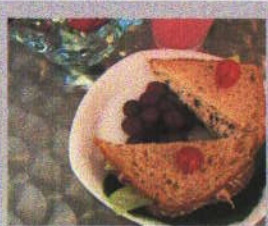
World Famous Chicken Salad

1300 Gendy St., Fort Worth, TX 76107 Inside the Fort Worth Community Arts Center www.zscafe.com 817.989.CAFE (2233)