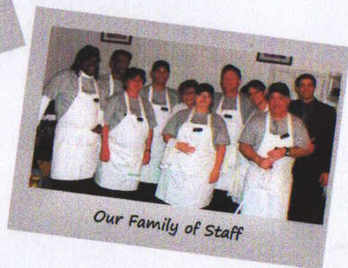
Our Family of Staff