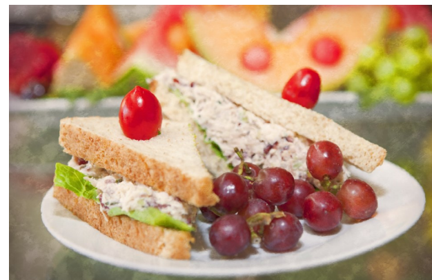
Z's Famous Chicken Salad

Voted Best Catering in Fort Worth 2014 & 2015